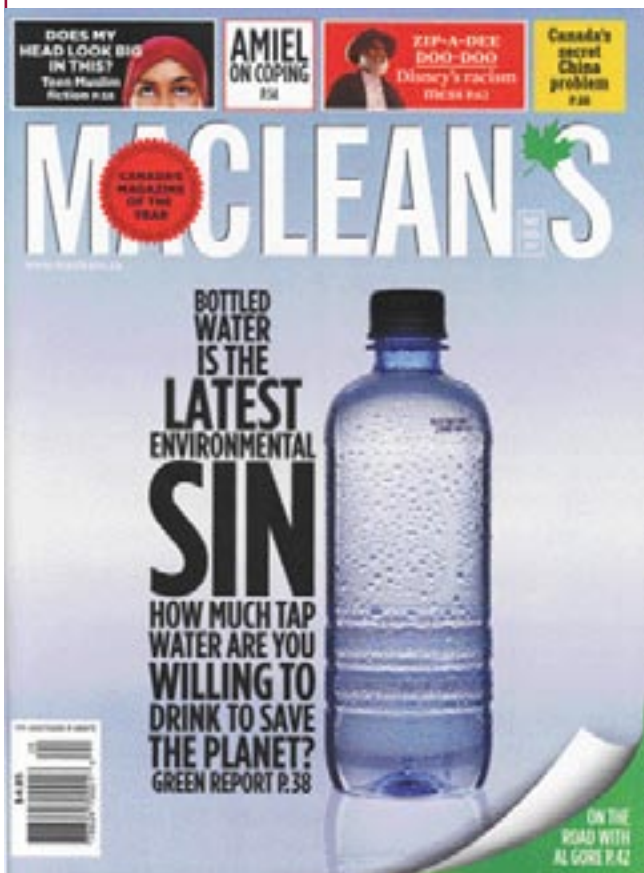
Maclean's Magazine May 14, 2007

Imagine Canada and Maclean's magazine have teamed up in a three-year partnership to engage Canadians in the charitable and nonprofit sector.